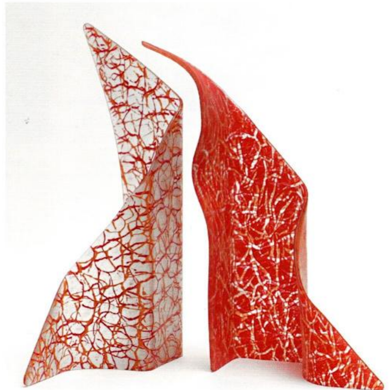
Ulrike Umlauf-Orrum: Object 1 and 2, untitled, glass, fused

invitation to show recent works again at the Lette Glass Museum. The internationally renowned lecturers, graduates, and students of the glass department of the Eugeniusz Geppert Academy of Art and Design in Wrocław are presenting around 50 works. Poland's vibrant glass scene, 8 June - 20 October 2024, Lette Glass Museum, Coesfeld-Lette. www.glasmuseum-lette.de